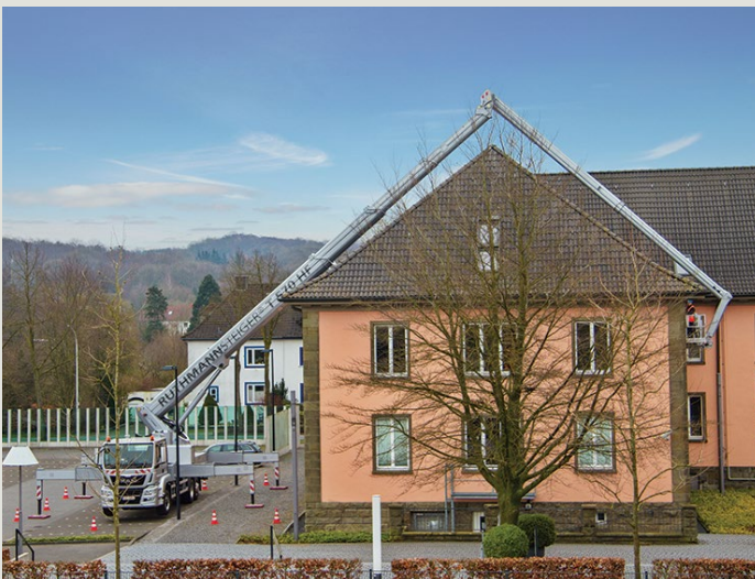
The latest highflex STEIGER®