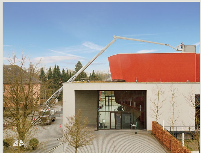
The maximum total length