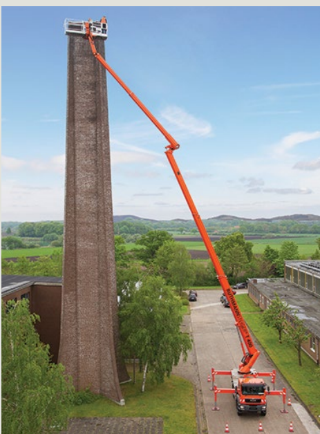
HEIGHT performance series

* Depending on load, angle of rotation and outfit.