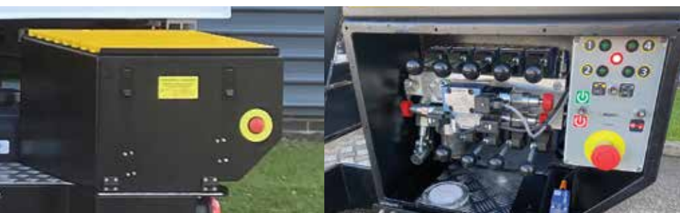
Hydraulic 12V DC emergency ground controls and emergency hand pump all located within a separate compartment to maximise bed space