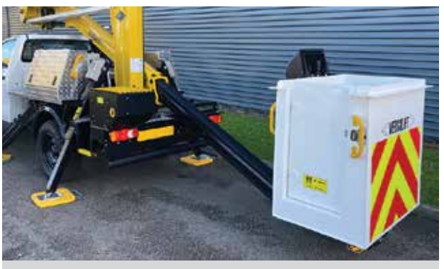
Safe access to bucket when in dock or from ground