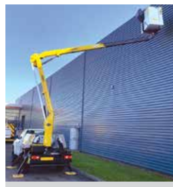
Zero tail swing on knuckle