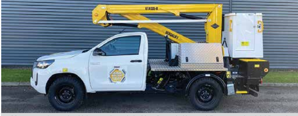
Manufactured from ultra-high strength steel, the Versalift profiled boom delivers exceptional rigidity and smooth operation on this low travel height platform.